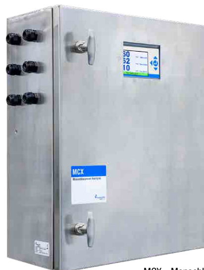
MCX - Monochloramine Analyzer

When a continuous process stream of water is flowing through the MCX, the instrument will take samples at preset intervals and display the readings. Reporting is made easy with a built-in display/control screen, along with standard 4-20mA outputs or Modbus communication outputs for instant data transfers.