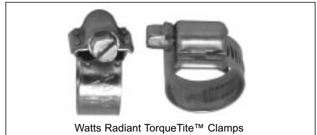
Watts Radiant TorqueTite™ Clamps