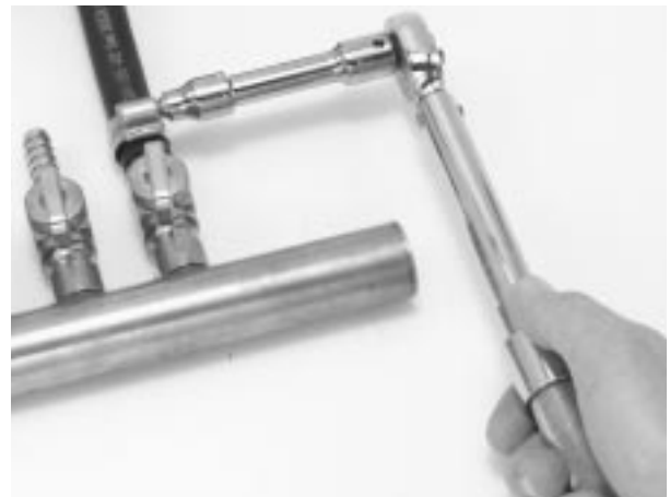
Tighten the clamp using an in/lb torque wrench.

Before sliding the Onix onto the barbed fitting, slide the TorqueTite clamp about three inches onto the length of Onix. Slide the Onix onto the barbed fitting. Slide the clamp back over the middle of the barbed area and tighten using an in/lb torque wrench.