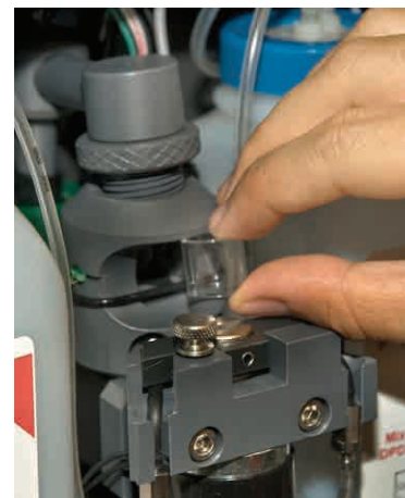
Changing the Sample Cuvette

HF scientific product specifications in U.S. customary units and metric are approximate and are provided for reference only. For precise measurements, please contact HF scientific Technical Service. HF scientific reserves the right to change or modify product design, construction, specifications, or materials without prior notice and without incurring any obligation to make such changes and modifications on HF scientific products previously or subsequently sold.