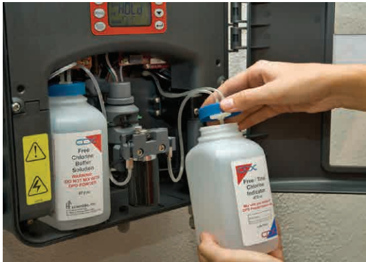
Changing the Reagents

The Residual Chlorine Monitor shall be able to measure free or total chlorine using the DPD colorimetric method. The Chlorine Monitor shall have a measurement range of 0-10 mg/l. The Chlorine Monitor shall include the power supply, sensor and display in one corrosion resistant enclosure. The Chlorine Monitor shall have readings consistent with laboratory and portable Chlorine Photometers. The Chlorine Monitor shall have standard 4-20 mA outputs and RS-485 with Modbus Protocol. The 4-20 mA output shall be standard or reversible. The Chlorine Analyzer shall have a removable sample cuvette. The sensor shall have a clear view to the optical chamber allowing viewing of the sample and reaction of the reagents, before, during and after a reading. Accuracy shall be \pm 5\% with a resolution of 0.01 mg/l for the range of 0-6 mg/l and \pm 10\% with a resolution of 0.01 mg/l for the range of 6-10 mg/l. The Chlorine Monitor shall have a user selectable cycle time between 110 seconds and 10 minutes (optional 60 seconds to 10 minutes). The Chlorine Monitor shall be capable of 30 days of unattended operation. The Chlorine Monitor shall take a zero reading before each reading to compensate for color in the sample. The Chlorine Monitor shall have microprocessor based technology. The Monitor shall have two user selectable alarm relays.