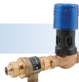
Dial-set Fill Valve & Backflow Assembly

The BD911ST-UT Fill Valve Assembly, a combination high-capacity fill valve, backflow preventer, and feed water pressure regulator, is packaged in one pre-assembled unit. This valve is designed for use on boiler feed lines to provide make-up water to the boiler and prevent backflow when supply pressure falls below system pressure. The assembly features a threaded union outlet for direct connection to the RBFF service fitting and a union inlet connection with both threaded and sweat tailpieces.