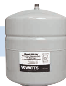
ETX-30 Hydronic Expansion Tank

Series ETX non-potable expansion tank is for use in closed loop hydronic heating system piping to control the thermal expansion of hot water and maintain system pressure below the relief setting of the relief valve.