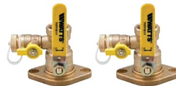
Flanged Isolation Valves w/Purge

During commissioning, by closing the Series PIPF-T's ball valve and connecting a hose to the purge fitting, an installer can push all of the initial air out of the system. PIPF-T replaces up to seven fittings with a single compact unit.