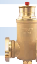
AS-MB FL Micro-bubble Air Separator

The AS-MB Air Separator employs rugged, corrosion-resistant coalescing media and a Duo Vent air vent assembly to provide micro-bubble air separation for a quieter heating system. The unit is fully serviceable in the field and comes in a flanged model designed to mate with the PIPF-T System Purge Assembly.